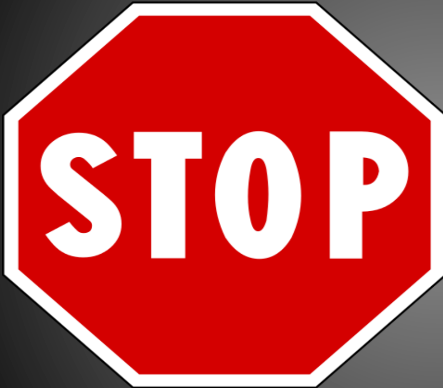
Code of Conduct NH's Principles of Professional Conduct